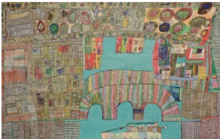
City plan, 70x46 cm, Acryl / ink on paper, Vera Sillen

Starting with details, Vera creates slowly her world, it takes time, but at the end a unique world unfolds.