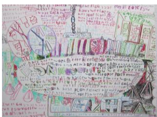
Thunderstorm 2, 50x65 cm, coloured pencil, René van Asch