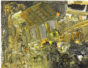
JKr 03 009, 50x65 cm, acryl on paper, Jaco Kranendonk