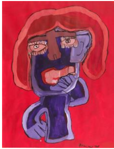
PG 96 031, 50x65 cm, acryl on paper, Paulus de Groot

In the project beautiful people www.beautifulpeople.nl images by Paulus de Groot have been used for a unique coffee set