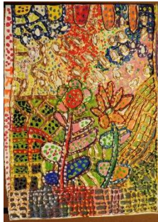
Flowerbed, 36x50 cm, Acryl on paper, Trees Bosch

In the magical world of Trees Bosch everything happens spontaneously, without a plan she starts and in thick layers of paint she creates here own universe.