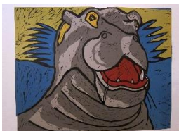
Hippo, 50x65 cm, footprint linocut 4/45