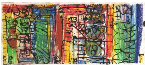
JK 06 131, 22x50 cm, acryl on paper, Jaco Kranendonk