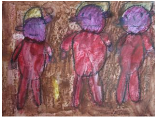
Three little men, 25x32 cm, mixed techniques, Steven Crone