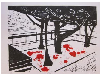
Lloyd Hotel, Gallery, 50x65 cm, footprint linocut 4/8