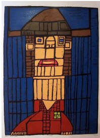
Beatrix, Princess of the Netherlands, 65x50 cm, footprint linocut 5/40