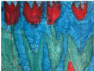
Tulips, 25x32 cm, mixed techniques, Steven Crone