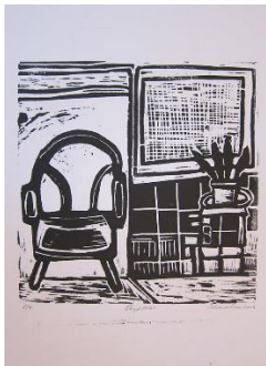
Lloyd Hotel, Chair, 28x28 cm, footprint linocut 2/4