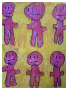
Six little men, 32x25 cm, mixed techniques, Steven Crone