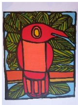
Bird "Piet", 65x50 cm, footprint linocut 5/50, Derk Wessels