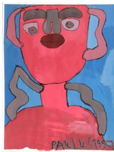
PG 98 004, 50x65 cm, acryl on paper, Paulus de Groot