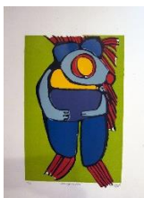
Pregnant mouse, 65x50 cm, footprint linocut 11/50, Derk Wessels