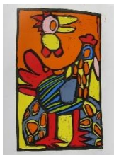
The chicken is happy, 65x50 cm, footprint linocut 24/55, Derk Wessels