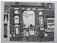
Transit the OHHoo Bargain Shop, 50x65 cm, marker / ink, Kitty van Straaten