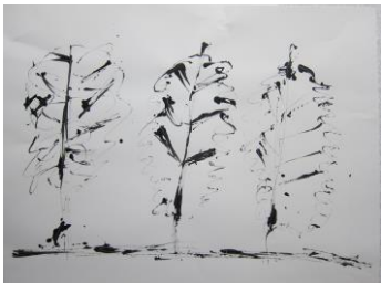
Leaves 2, 50x65 cm, ink, Peep Arlar