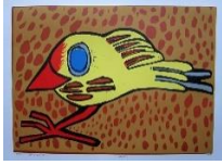
Canary, 50x65 cm, footprint linocut 14/55, Derk Wessels