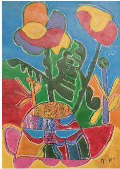
Vase, 34,5x50 cm, Acryl / ink on paper, Mira Moonen

Mira is a happy woman, flowers, birds, in bright colors she brings here ideas to live.