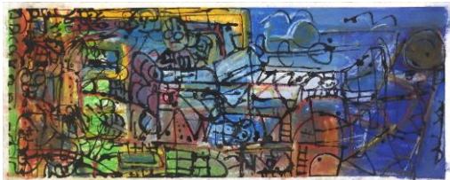
JK 06 127, 20x50 cm, acryl on paper, Jaco Kranendonk