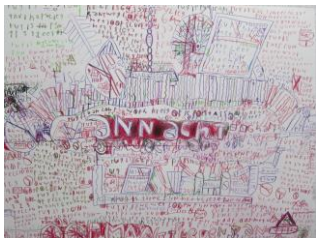
Thunderstorm 1, 50x65 cm, coloured pencil, René van Asch