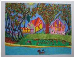
Holiday Island, 50x65 cm, coloured pencil, Kitty van Straaten