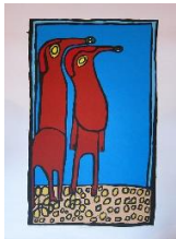
The Meerkats, 79x60 cm, footprint linocut 58/60, Derk Wessels