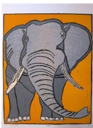
Elephant, 65x50 cm, footprint linocut 37/50